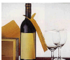
LANDOLIUM Hulshout 0032(0)15/222911