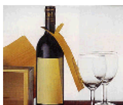
LANDOLIUM Hulshout 0032(0)15/222911