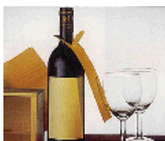
LANDOLIUM Hulshout 0032(0)15/222911