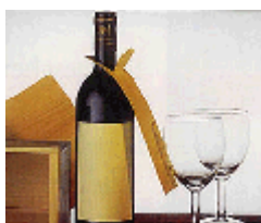
LANDOLIUM Hulshout 0032(0)15/222911