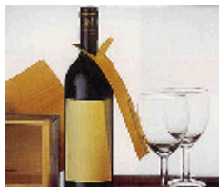
LANDOLIUM Hulshout 0032(0)15/222911