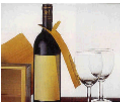
LANDOLIUM Hulshout 0032(0)15/222911